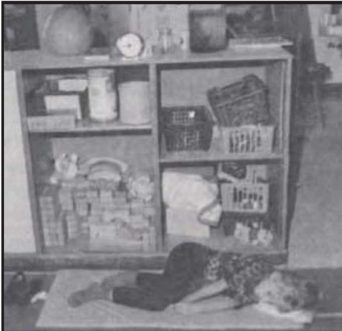
An easy earthquake safety measure: store heavy objects like wooden blocks on the lowest shelf

Overturning file cabinets or shelving or hazardous materials falling off shelves and spilling are examples of nonstructural earthquake hazards. These hazards are distinct from damage to the structure-- the columns, beams, load-bearing walls, and floors that support a building.